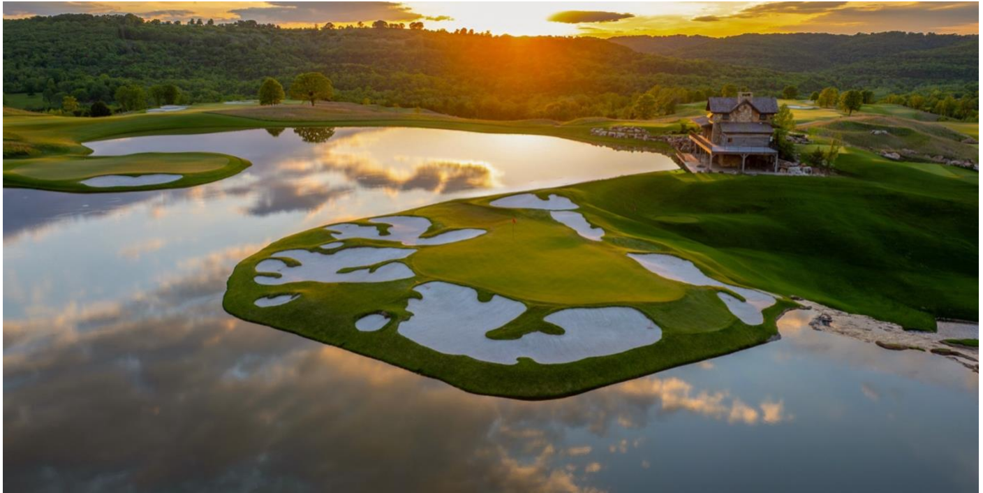
CLIFFHANGERS BREATHTAKING 14 th HOLE PENINSULA GREEN COMPLEX

WHEN YOU PLAY AT BIG CEDAR, YOU'RE NOT JUST ENJOYING THE GAME – YOU'RE HELPING CONSERVE THE WILD HEART OF THE OZARKS FOR GENERATIONS TO COME !