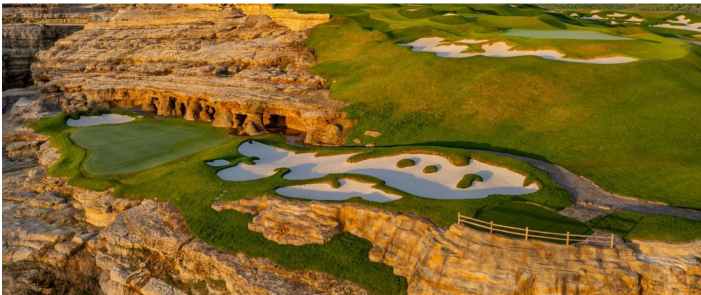
CLIFFHANGERS BREATHTAKING ULTRA-DRAMATIC FINISHING HOLE