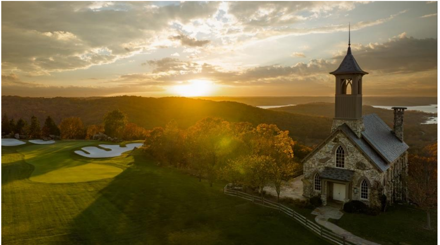
Legendary Top of the Rock