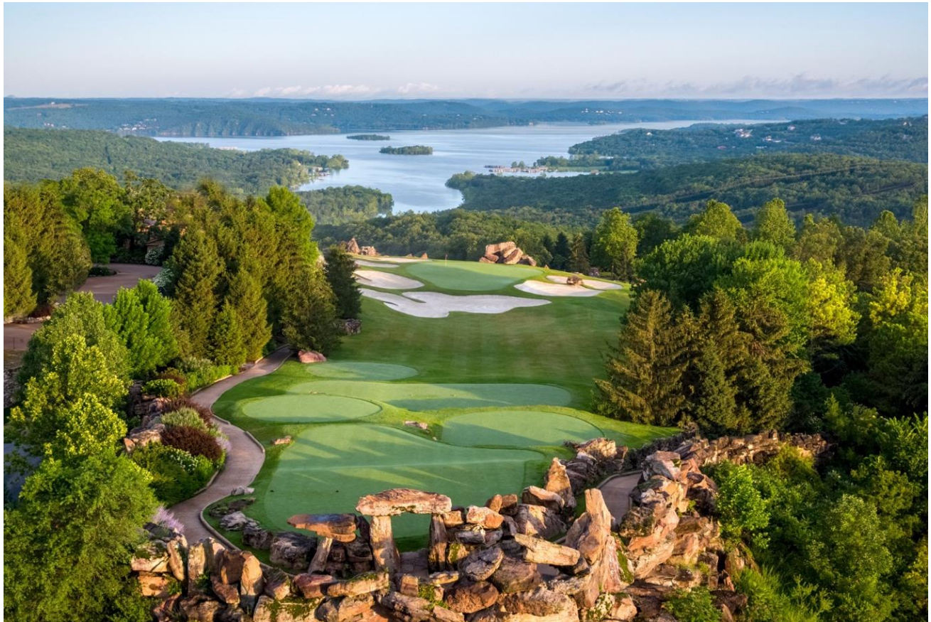
Top of the Rock by Jack Nicklaus The only par-3 course to host PGA sanctioned events

Not to be outdone, another legend, Gary Player, built the 13-hole Mountain Top par-3 course, pictured below at sunset and as its name implies, the elevated setting, sweeping views and nature are paramount.