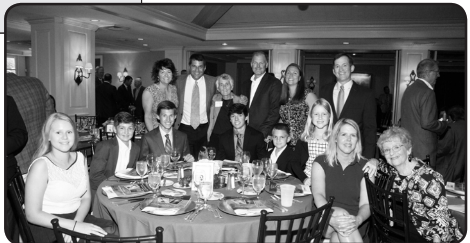
The MacGee Family 2016