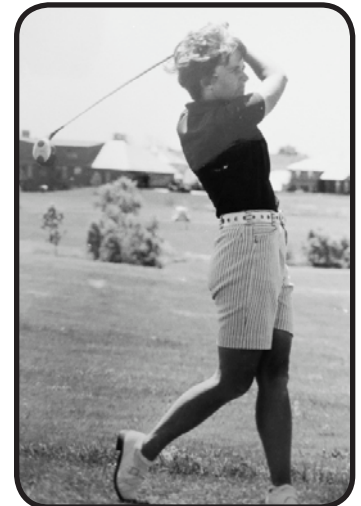
The swing 1960's