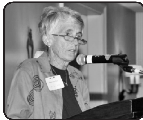
2016 at Kansas Golf Foundation Hall of Fame induction