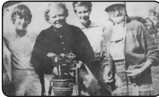
with Patty Berg and Opal Hill 1960's