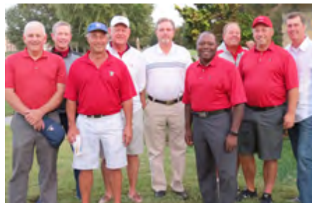
East Senior Cup Team 2017