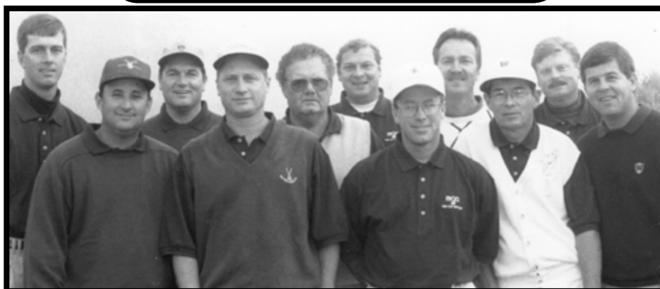
1996 Missouri Cup East Team