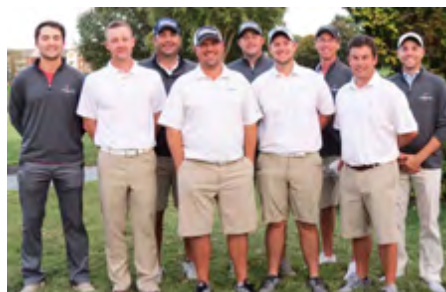
East Hieronymus Cup Team 2017