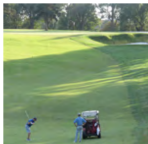
Twin Oaks CC # 14 par 5