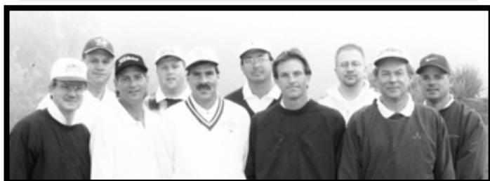
1996 Missouri Cup West Team