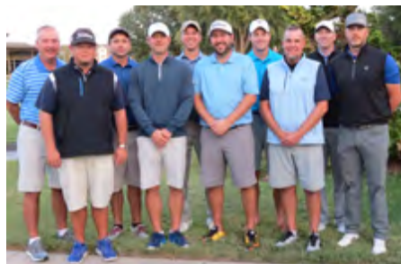
West Hieronymus Cup Team 2017