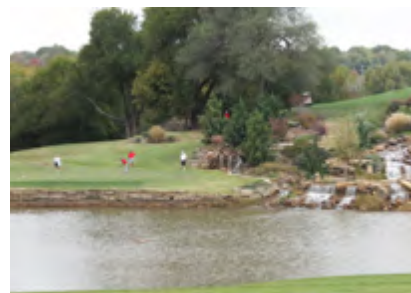
Twin Oaks CC # 15 par 3