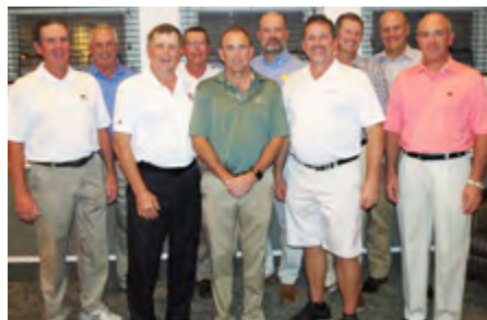
West Senior Cup Team 2017