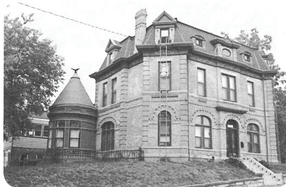
The Corby Mansion, built in 1882, where the club was founded in 1898. 302 S. 11th Street.